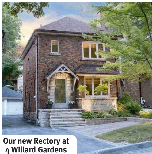
Our new Rectory at 4 Willard Gardens

We are pleased to announce the acquisition of a new Rectory! Our previous Rectory was sold on July 5, for $1.69 million. With the proceeds, the new Rectory at 4 Willard Gardens was bought for $1.32 million on August 15. The difference (after the fire system work is complete) will be invested in the Consolidated Trust Fund in the Diocese, to generate quarterly dividends to St. Olave's to be used