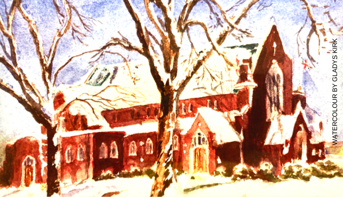
WATERCOLOUR BY GLADYS KIRK